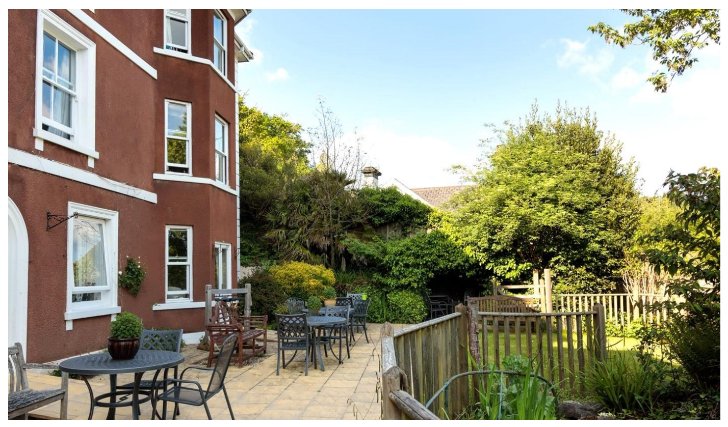
A vibrant place to be, with a range of activities

Your family members are given plenty of opportunities to take part your care and are always welcome. They of course are always welcome to drop by whenever, receive regular updates with staff and management and even attend private appointments with our staff regarding your care. Either a phone in your room or access to the home's phone is available and we can organise video calls and regular get-togethers too. Our aim is to make sure you never feel out of touch.